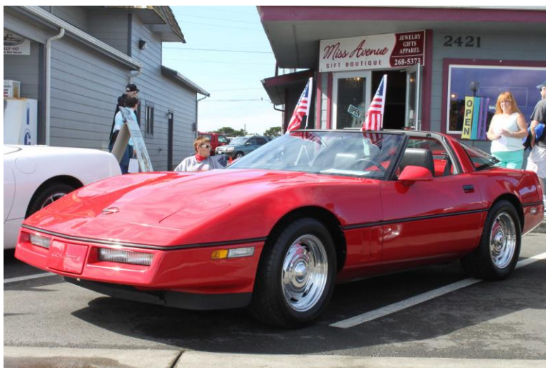
Kristi's '85 at Westport